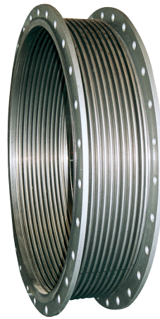
DN 600 - DN 2800